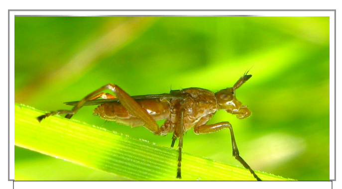
Marsh Fly (Sepedon (Sphegea) pacifica)

Our Madrona Marsh Preserve has been placed on the scientific map. During the 2009-2012 time-frame, a biodiversity study of our Preserve was conducted. The invertebrates part of this study, conducted by Emile Fiesler, revealed quite a few surprises, including a number of flightless species that have survived the ages and various land uses of the Preserve.