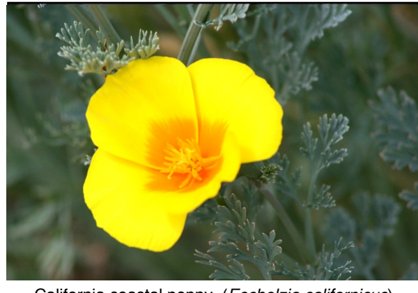
California coastal poppy (Escholzia californicus)

CNPS and PVPLC. And remember, CNPS shares a generous percentage of its net profit with the Friends, so you'll be helping us as well as them.