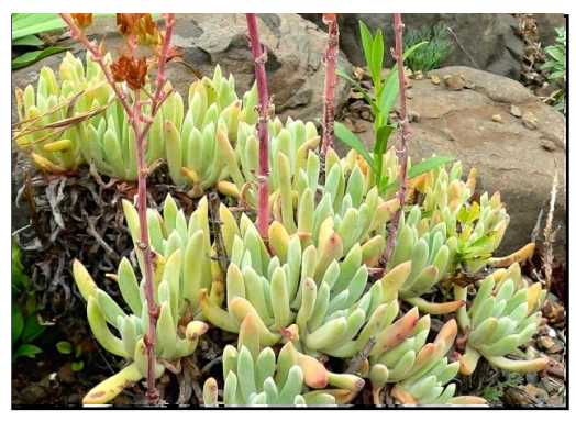
Bright Green Dudleva (Dudleya virens) which CNPS uses as its logo.

As usual, the South Coast Chapter of CNPS is welcoming members of the Friends of Madrona Marsh to their early sale, along with members of