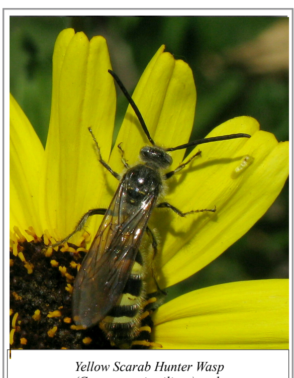
(Campsomeris pilipes) male

The article contains the complete list of 689 taxa (species equivalent) that were recorded, together with methodologies and an analysis of the results, as well as a summary of other invertebrate biodiversity studies in our region and associated bibliography.