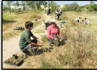
Earth Day with Marriott volunteers