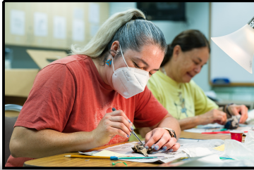
Creating study skins

Torrance Refinery is a long time supporter of educational programs at the Madrona Marsh including the Nature Festival planned for April 2023.