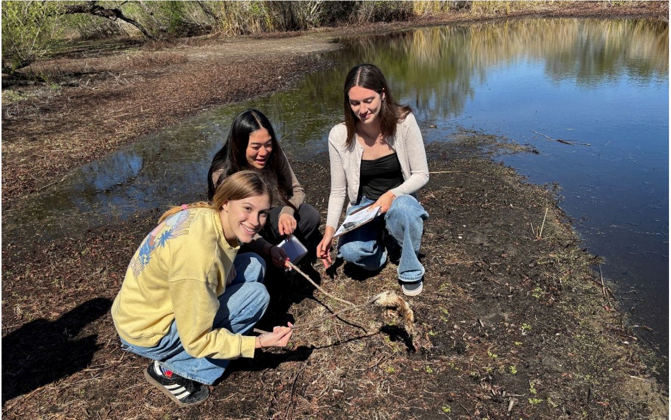
Redondo Union High students examine possum carrion as part of their field study.