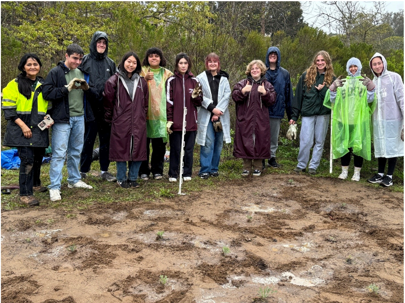
Torrance High students planting poppies in the prairie as part of their State Civic Seal of Engagement program.