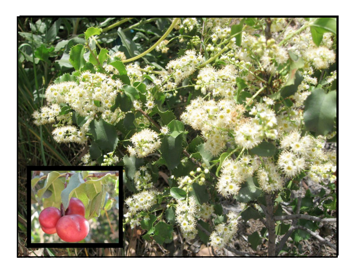
Evergreen cherry/Islay Prunus ilicifolia

Native trees and large shrubs make good sense. They provide shade and privacy and can serve as habitat anchors for an entire garden. A nice example—the native Evergreen cherry—can be seen in the Madrona Native Plant Gardens.