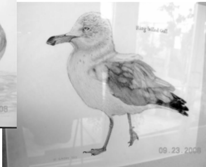
. . . Ring Billed Gull

I'm sure "Winged Migration" has inspired many to take up birding, but Ivett has taken her birding to a new level by photographing the birds, then drawing