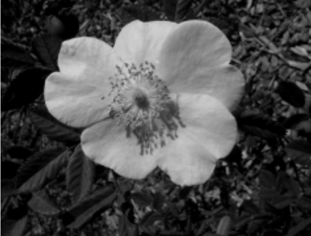
California Wild Rose – Rosa californica

In many ways, the Southern California fall season is a time of waiting. Many native plants are dormant, awaiting the winter rains. But some native species—including those that bloom and set fruit in summer—are quite active during this period. Several native fruits only ripen with the cooler weather. These fruits provide important food for fruit-eating birds such as migrant Cedar Waxwings and Grosbeaks and resident Mockingbirds. One important native fruit-bearing shrub is the California Wild Rose ( Rosa californica ). The sweet fruits—the ‘rose hips’—provide a tasty treat for birds, mammals and even humans.