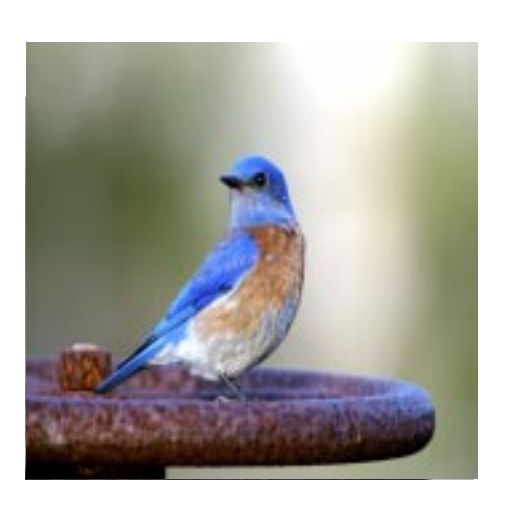
"Scientists..." continued on page 3.

Finally, little blue flew over to a nearby tree and I went back to completing the log. I heard little blue's mate calling and he did too. He flew west to greet her.