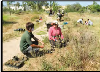
Earth Day with Marriott volunteers