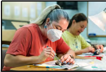
Creating study skins

Torrance Refinery is a long time supporter of educational programs at the Madrona Marsh including the Nature Festival planned for April 2023.