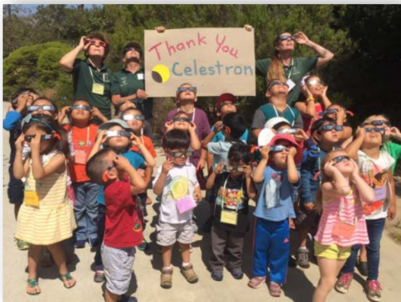
Friday Fun Class with Solar Glasses