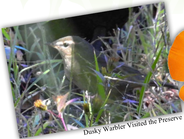
Dusky Warbler Visited the Preserve